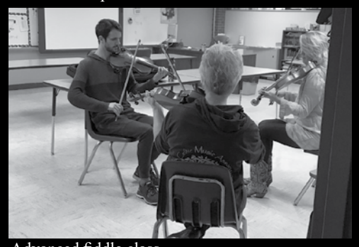
Advanced fiddle class