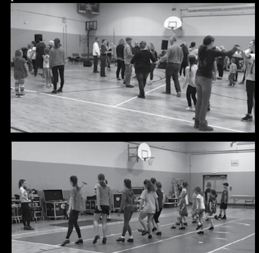
Advanced step dance class