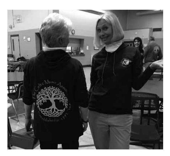
Long sleeve hoodies in dark blue, $25 for sizes Med., XL $30 for 2X and 3X.