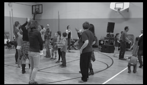
Pre-ceili dance instruction before the mashed potato bar buffet dinner.